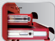
• Ball bearing slides