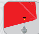
• Bottom rubber mats to avoid slipping