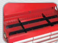
• Plastic drawer divider for cabinet