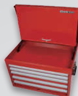
87419-5B (Extra deep)