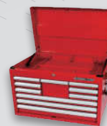
87417-10B (Extra deep)