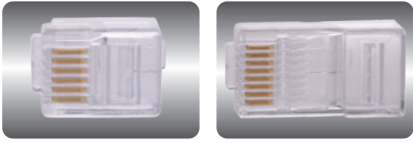
• 6P • 8P