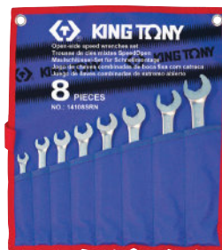
► Teton pouch bag